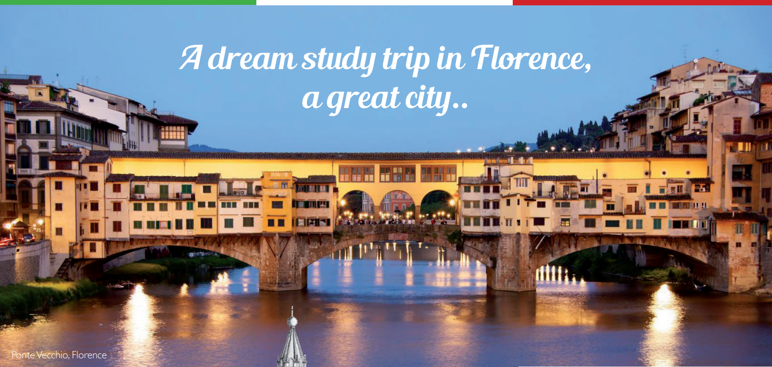
Ponte Vecchio, Florence

A dream study trip in Florence, a great city..